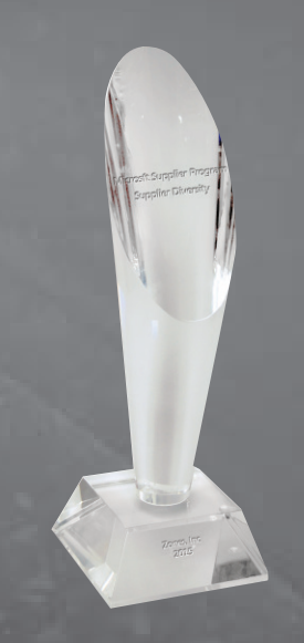
2015 Microsoft Diversity Excellence Award