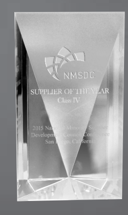
2015 National Supplier of the Year, Class IV, National MSDC