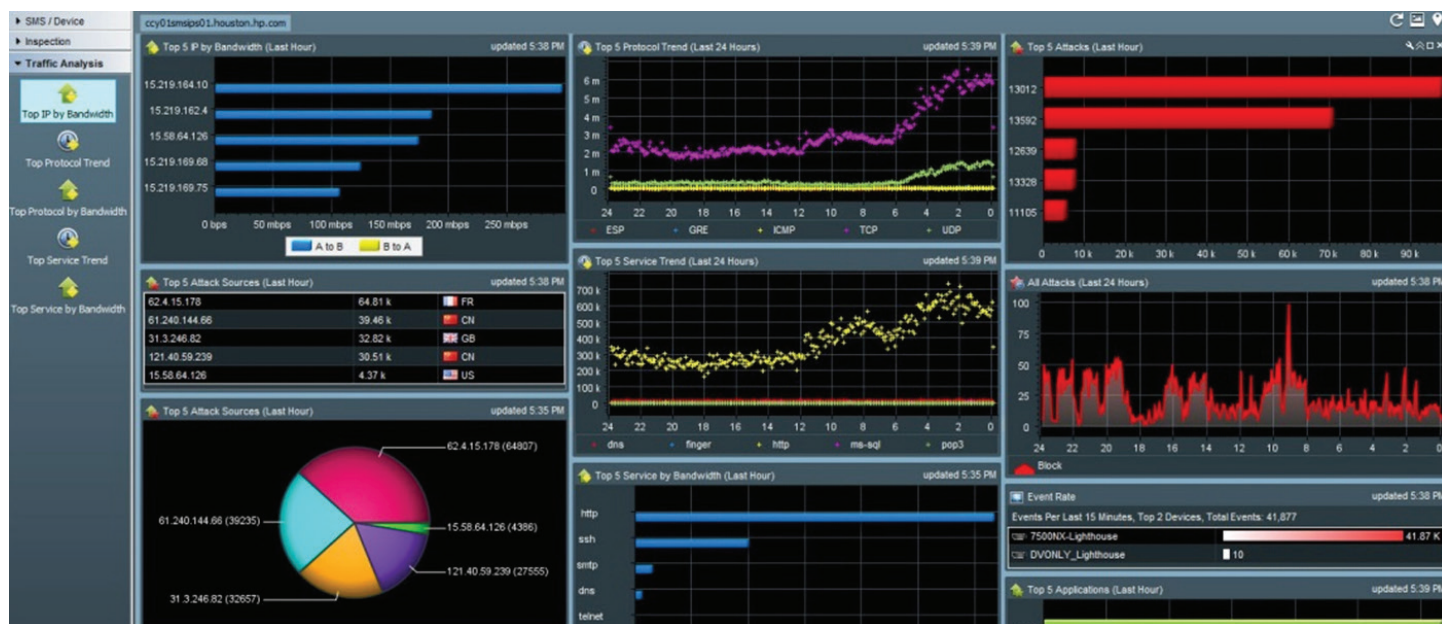
TippingPoint Security Management System Dashboard

One of the most critical challenges facing security teams is effectively managing their network security deployments. Securing network and data assets within the perimeter, core, or data centers and in hybrid networks—including both physical and virtual appliances—requires the management framework to span across multiple boundaries. TippingPoint Security Management System (SMS) appliance provides a unified management interface and a global vision and security policy control for large-scale deployments. It delivers a robust management functionality and flexible physical and virtual deployment options.