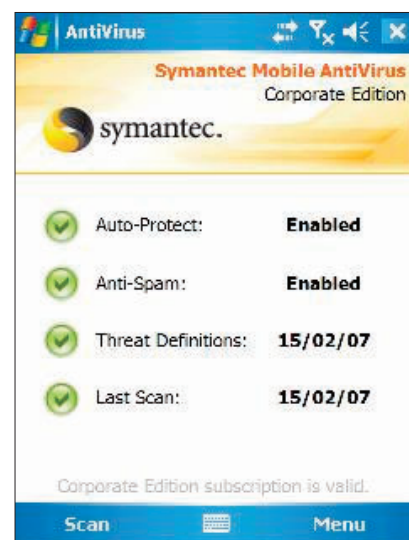
Figure 1. Protection status screen on the device