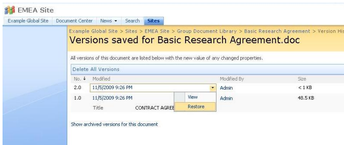
Figure 2. Version pruning removes document versions from SharePoint yet maintains accessibility.