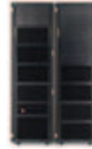
HP StorageWorks XP20000 Disk Array