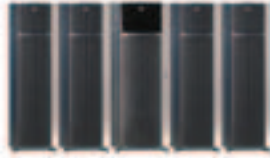
HP StorageWorks XP24000 Disk Array