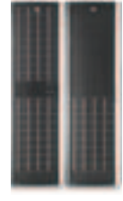
HP StorageWorks 8400 Enterprise Virtual Array (EVA8400)