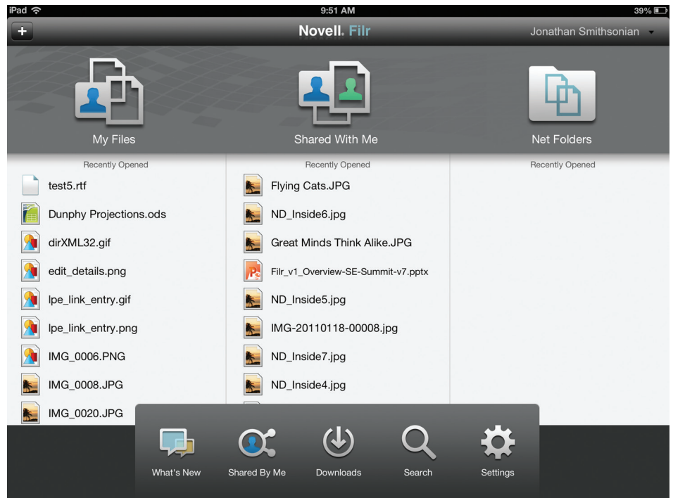
Figure 2. Novell Filr provides users with a consistent file access experience whether they access their files on the iPad as shown here, on their smartphone or on their laptop.

Your IT staff can manage Novell Filr from a web portal that lets them monitor and control file use and sharing. They can do so from wherever they have Internet access.