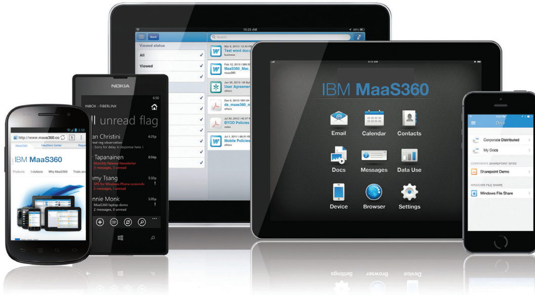
Figure 1: Examples of MaaS360 on various devices