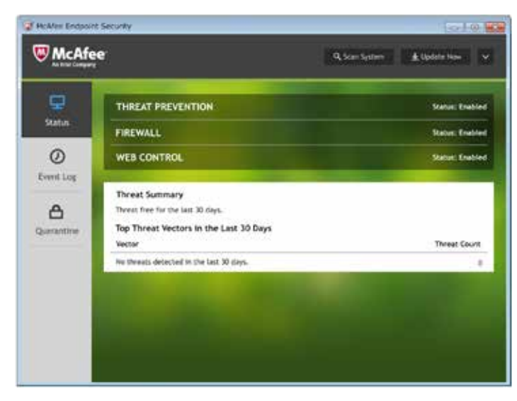
Figure 2. Intuitive user interface for local configuration.

Figure 1. Manage your business security using a simple dashboard on premises or in the cloud.