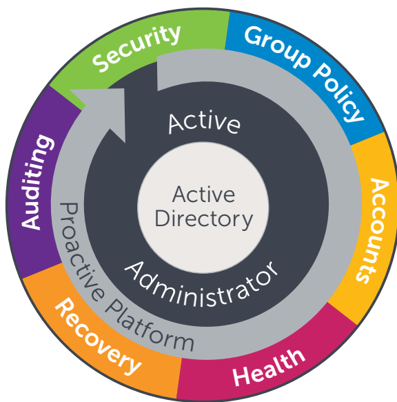
Figure 1. Active Administrator delivers a complete solution for managing your Active Directory