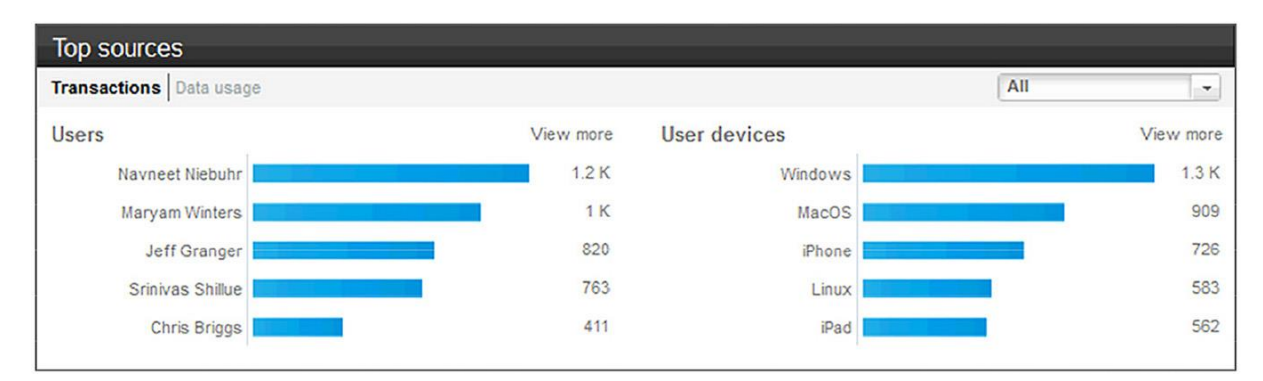
Figure 3. Report of Facebook Access by User