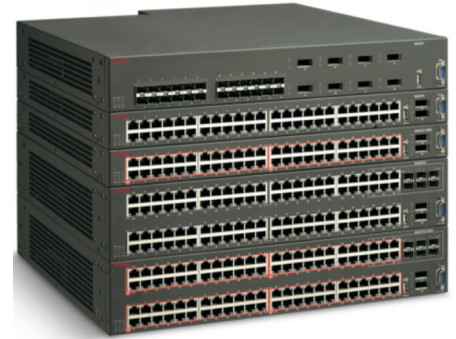
ERS 5600 stackable chassis system

Premium Stackable Chassis system providing the resiliency, increased security and convergence-readiness required for today's high-end wiring closets, high-capacity data centers and network core environments.