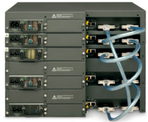
ERS 5600 Stacking Cable Interconnection

From a management perspective, our Stackable Chassis appears as a single networking entity – utilizing only a single IP Address. This can significantly reduce the number of switches to be managed within the network as a stack of up to 8 switches can be managed just as easily as a single switch. Distributed real-time monitoring of the Stackable Chassis also provides an at-a-glance view of operational status and health which