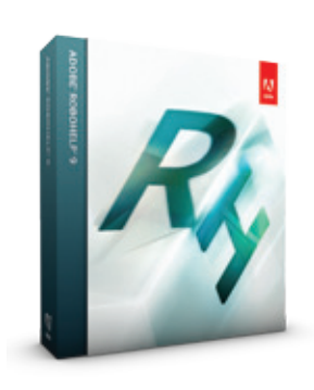
Test drive Adobe RoboHelp 9

Shared reusable resources —Save time and boost productivity by reusing assets across authors and projects. Maintain consistency and conform to organizational and industry standards using linked resources that can be updated simultaneously.