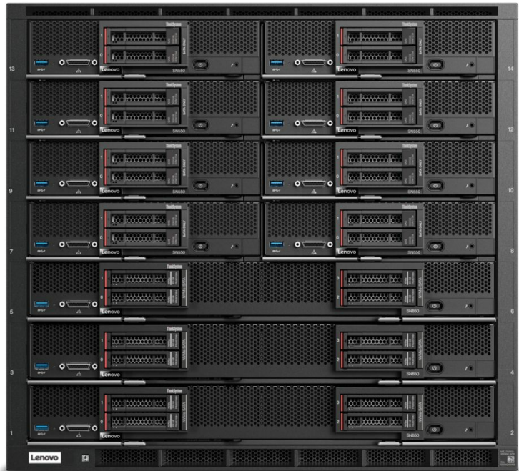
The Flex System Enterprise Chassis houses up to 14 SN550 compute nodes, delivering high density.

Flex System is a second-generation blade system that has helped customers streamline their infrastructure since 2012. The ability to run four generations of Intel® Xeon® processor-based blades concurrently in the same chassis makes Flex System ready for the future-defined data center.