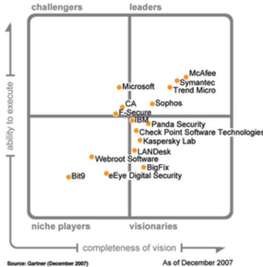
McAfee was positioned in the Leaders Quadrant of Gartner, Inc.'s Endpoint Protection Platform Magic Quadrant

Remember the days when anti-virus was synonymous with security? Today, anti-virus alone doesn't do the job. Medium-sized businesses need desktop and server security that can keep up with the ever-changing landscape of sophisticated blended threats. Rated number one three years in a row by industry analysts, McAfee endpoint protection helps medium-sized businesses stay ahead of the cybercriminals with technologies such as host intrusion prevention and desktop firewall for immediate, automatic protection against most operating system vulnerabilities the minute they're announced.