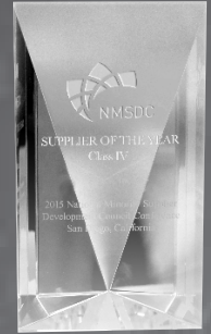
2015 National Supplier of the Year, Class IV, National MSDC