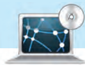
DESKTOP BACKUP & RECOVERY

End-to-end, continuous protection – without the complexity